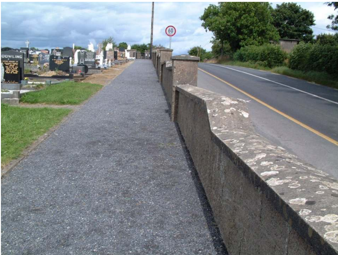
Part of Boundary