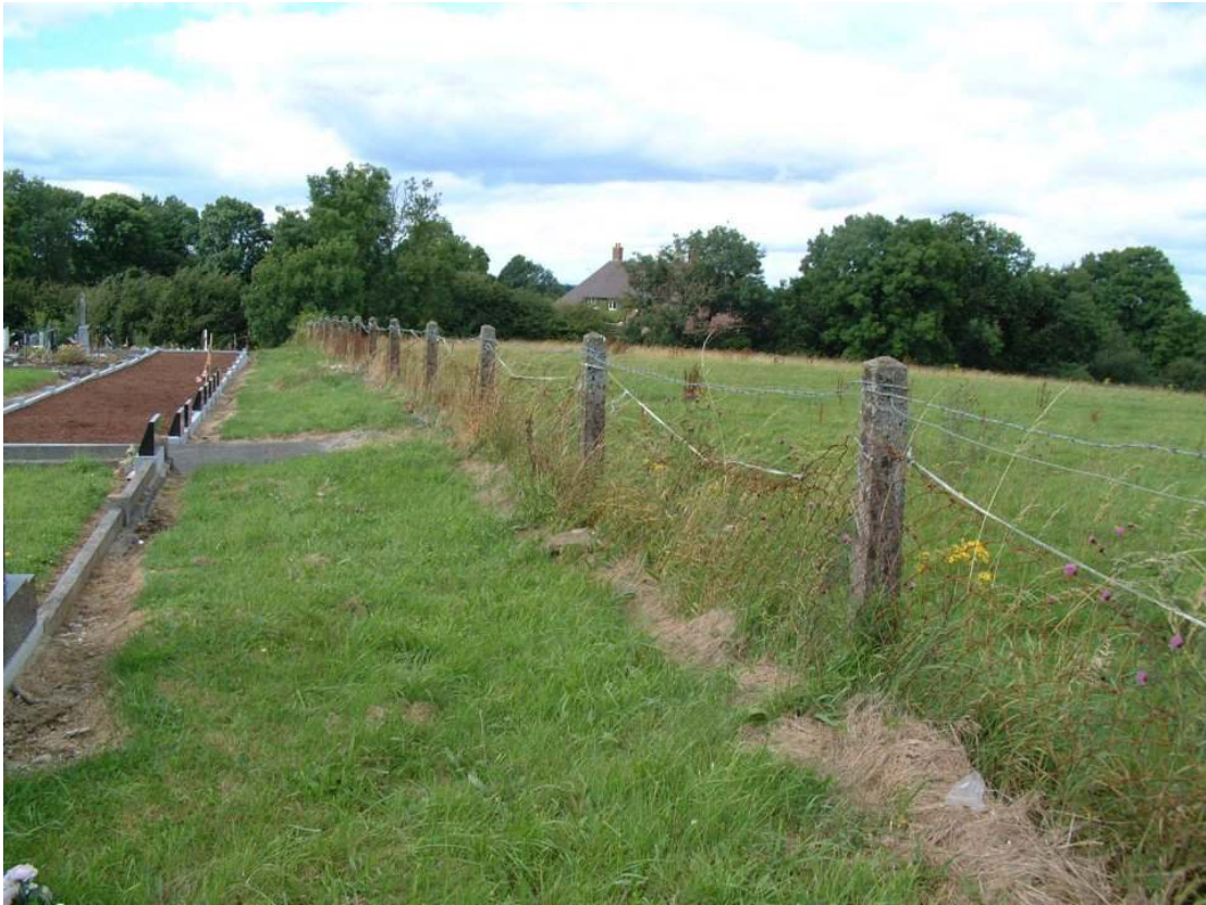
Part of Boundary