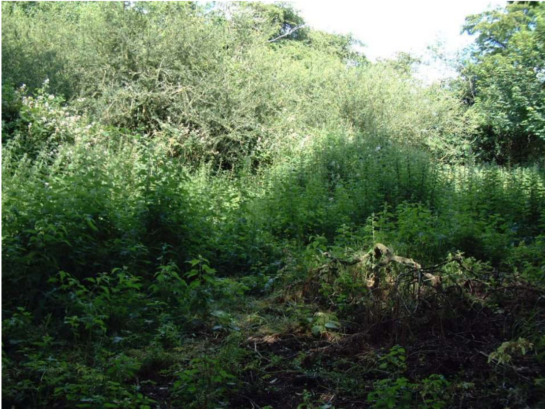
Site from another angle