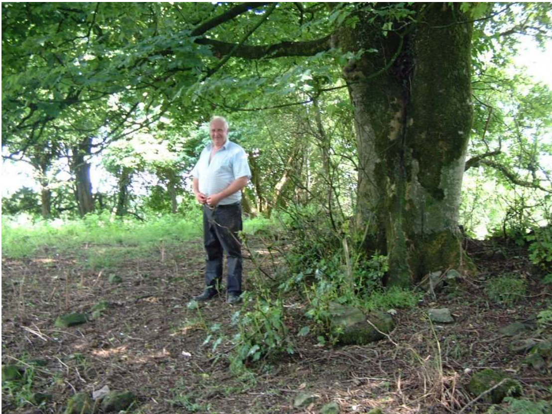
Close up of site