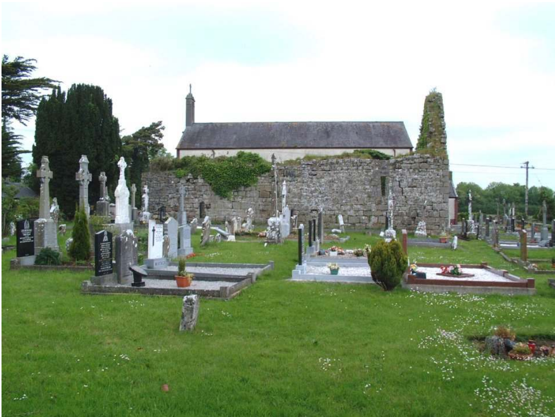
Overview with Catholic Church in the background