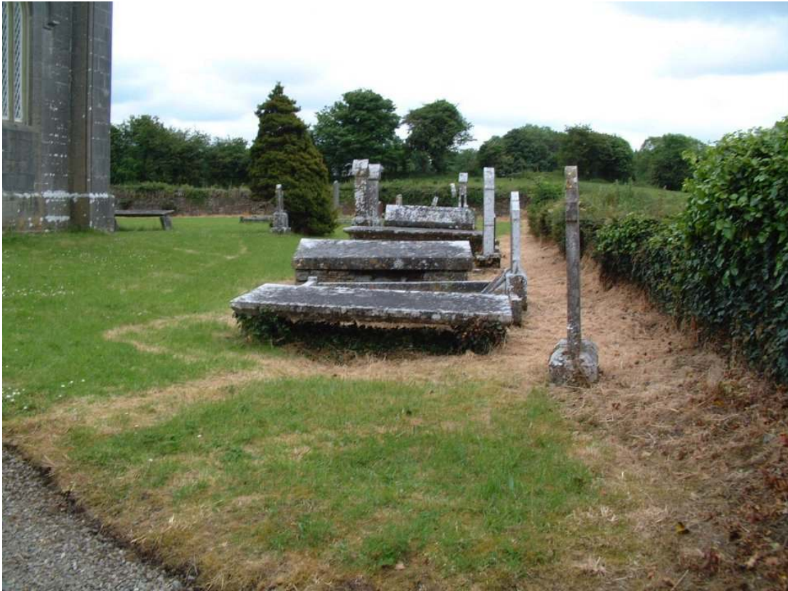
Overview of a section of cemetery