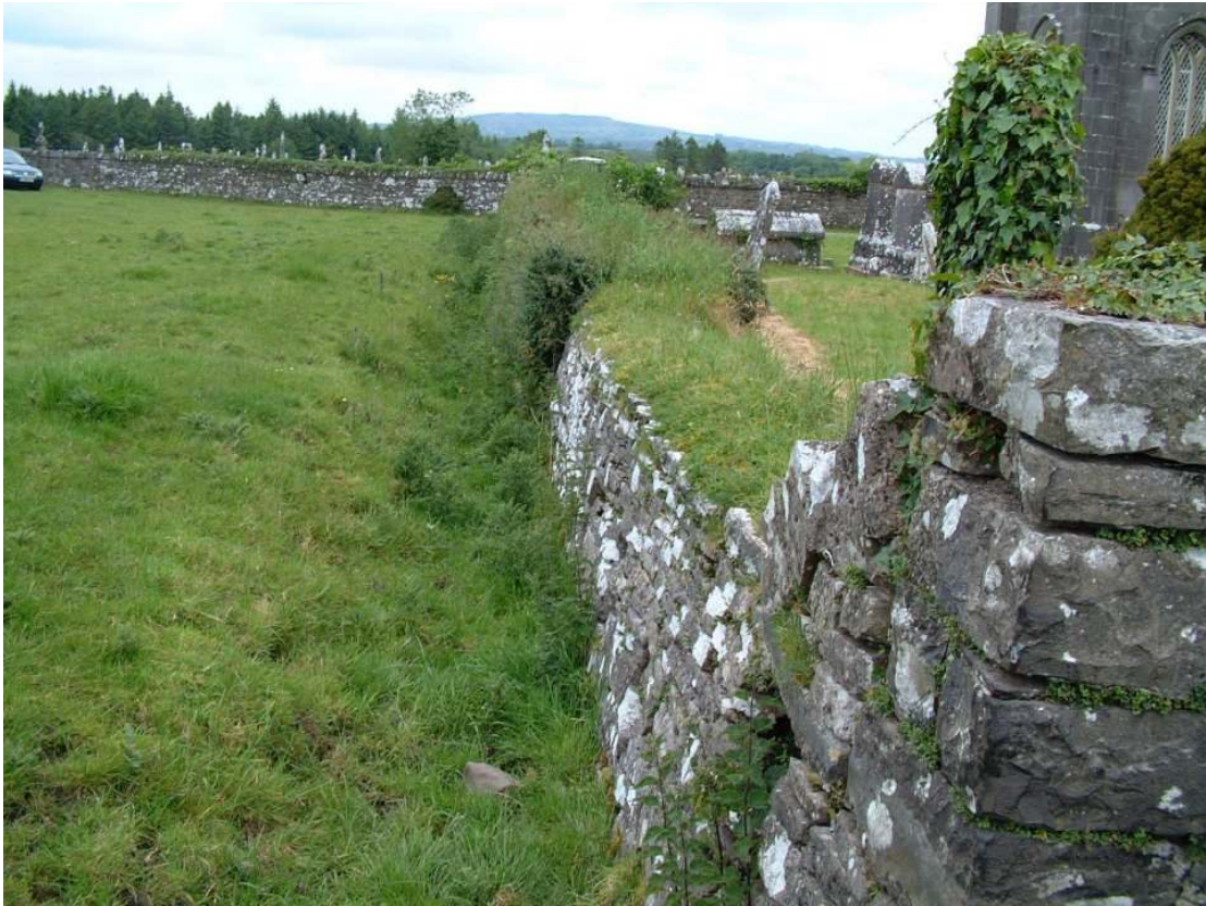
'Ha-Ha' Style Fence