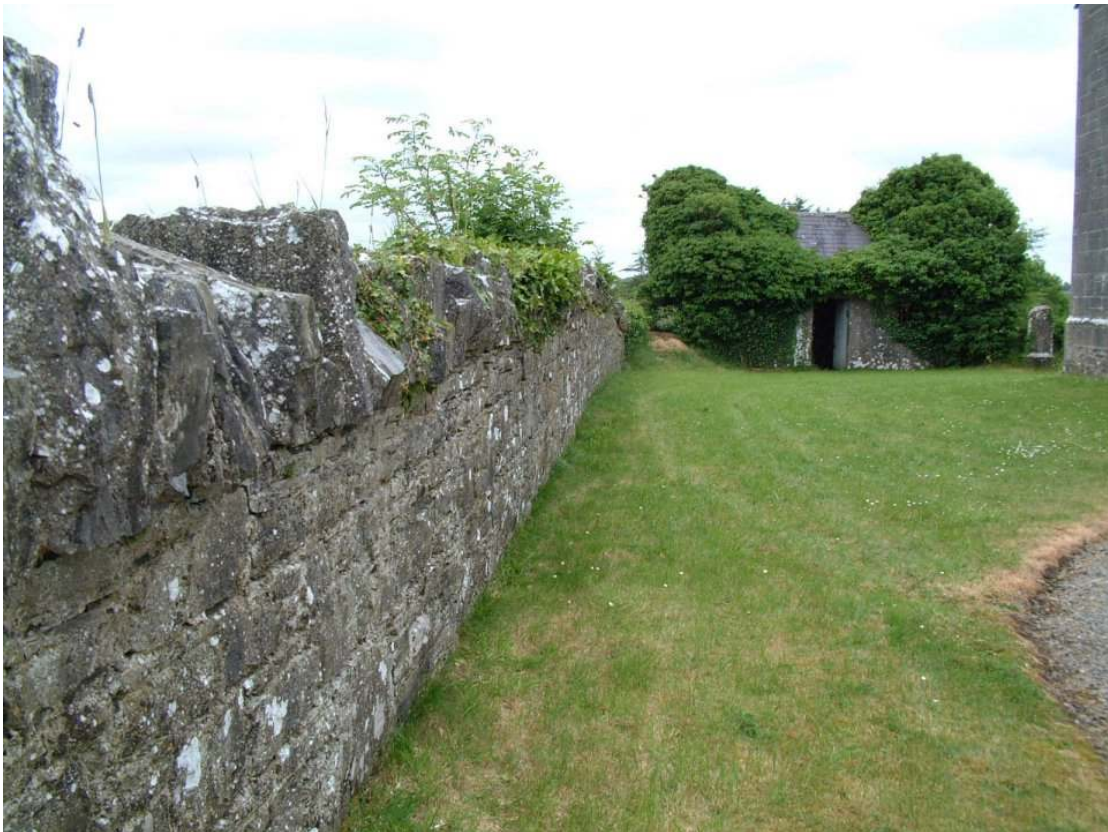
Section of Boundary Wall