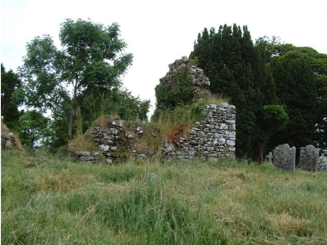
Ruins of Church