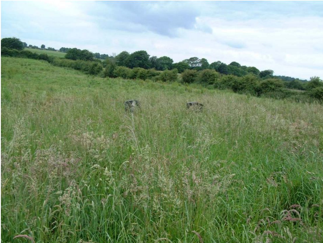
Overview of part of Cemetery