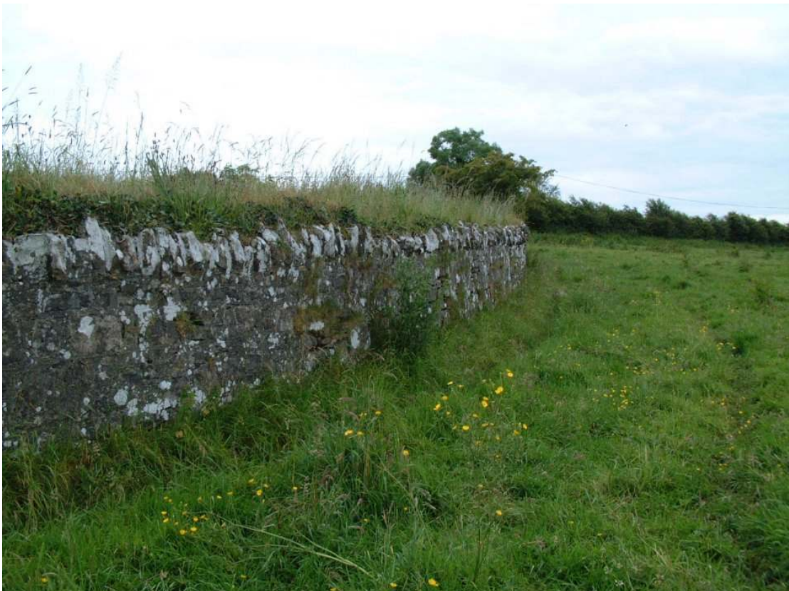
Section of Boundary Wall